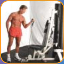
Standing One Arm Curl