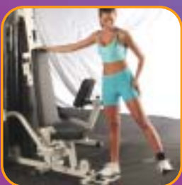
Inner/Outer Thigh Kick